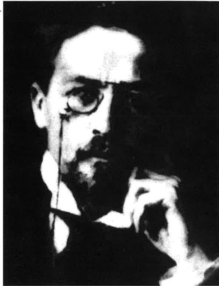
Above Chekhov in 1883

Throughout his life, Chekhov was plagued by ill